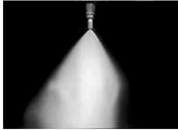
Table 4 Atomizing Nozzle